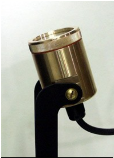
Bronze Light with Thermoplastic Mounting Bracket and Brass Screws