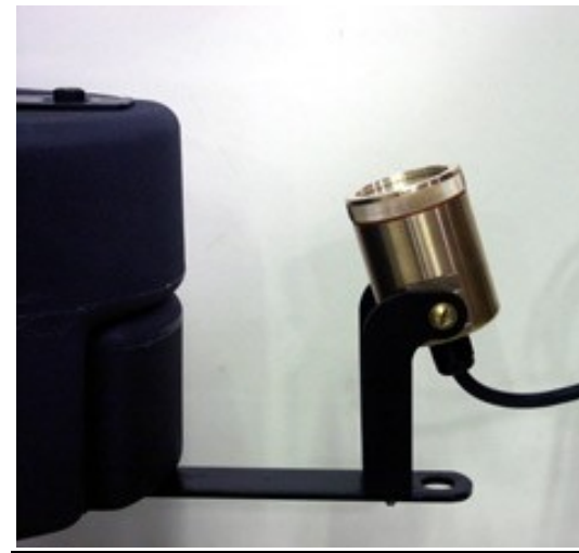
Bronze Light Attached to 3-Piece Float