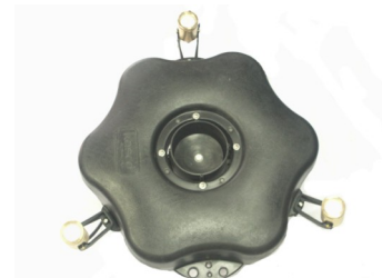
3 Light Orientation on Float