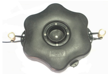
2 Light Kit Orientation on Float