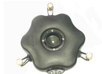
3 Light Orientation on Float