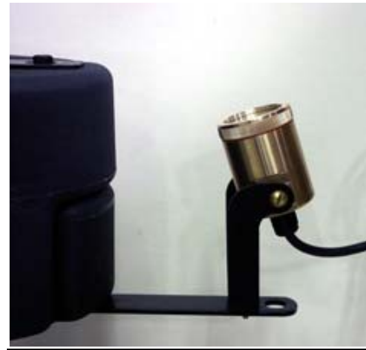
Bronze Light Attached to 3-Piece Float