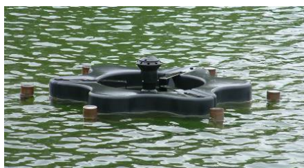
Unit Pictured with 2 LE375 Light Kits