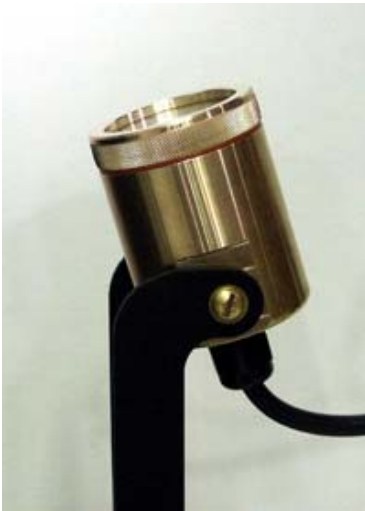
Bronze Light with Thermoplastic Mounting Bracket and Brass Screws