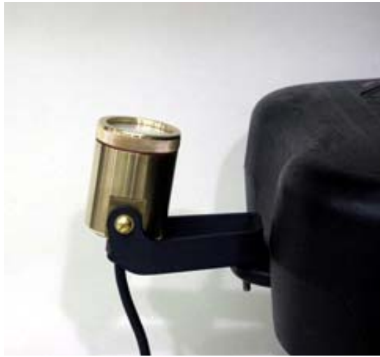
Bronze Light Attached to Single Piece Float