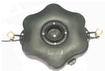
2 Light Kit Orientation on Float