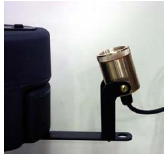
Bronze Light Attached to 3-Piece Float