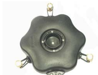
3 Light Orientation on Float