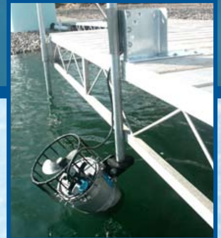
Special dock mount helps circulators direct debris away from boats in a marina.