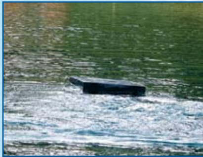
Efficiently eliminate stagnant water in ponds

Each unit is manufactured of the highest-grade industrial components in our facility in Wisconsin and is designed to meet UL safety standards as a complete package. Units are engineered to be fully compatible with salt-water applications.